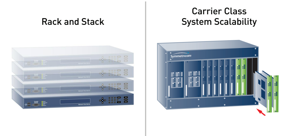
FIG. 2 Carrier class systems with card-based NTP servers are designed to scale as the network grows.

Capacity is measured in terms of the number of requests for timestamps that can be served within a given period with a given level of accuracy. For example, a server able to deliver 2000 requests per second with 10-microsecond accuracy would be considered carrier-class. Another consideration is the ability to scale up capacity within the SSU. If servers were implemented as blades, for example, you might simply add more blades on a SSU shelf to double or triple the number of clients and client requests served without re-architecting the entire server configuration or taking up more floor space.